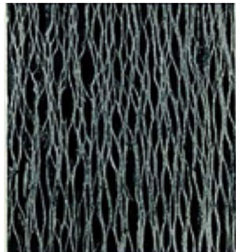
FIGURE 1 Distribution and network of vascular tissue in a single stem layer of Papaya . According to the text in the script, there are 20 such layers of vascular tissue, one inside the other (like Russian dolls) and surrounding the whole trunk. The bundles are connected through enormous numbers of tangential connections and perhaps anastomoses to form a complex excitable structure. “The existence of a system of nerves enables the plant to act as a single organised whole” a requirement perhaps for selection on fitness. Figure and quote taken from fig. 54, page 121, Bose (1926) [Colour figure can be viewed at wileyonlinelibrary.com ]

In very young plants, such as Helianthus seedlings, phloem anastomoses (cross links), up to 7,000/stem internode in number, have been reported. How common this cross linking might be remains unknown (Aloni & Barnett, 1996; Aloni & Sachs, 1973). It is speculated that auxin might be responsible for their formation, and that they might have a function in xylem regeneration. Computer-assisted tomography has been used to identify a complex network of xylem vessels (Brodersen et al., 2011). However, xylem does not differentiate in the absence of phloem, although the converse is not true (Roberts, Gahan, & Aloni,